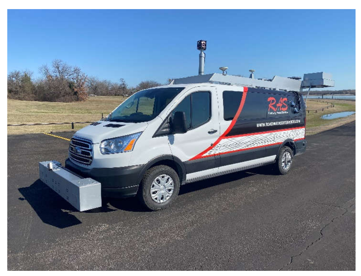
A Roadway Asset Services, LLC automated data collection vehicle

The CONSULTANT team consists of a driver and operator whom will systematically drive the automated data collection vehicle on the road segment listings provided by the OWNER. The CONSULTANT will collect pavement data on lane lines shown on the shapefile provided by the OWNER. CONSULTANT proposes to use its collection vehicle line scan camera with laser illumination and right-of-way cameras to capture pavement and ROW images to be used during the pavement rating process. Unpaved roads, shoulders and medians will not be surveyed.